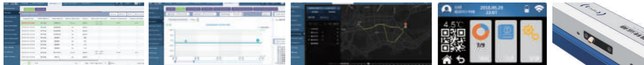
Temperature data upload record